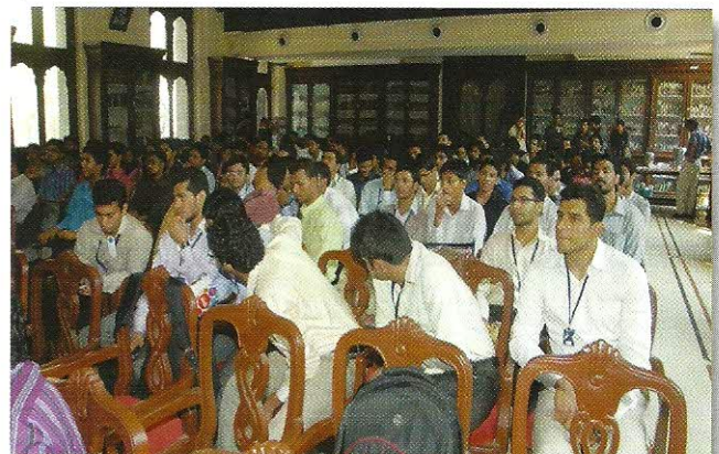
A view of Audience

Ms. Monique Coleman replied aptly to each and every question.